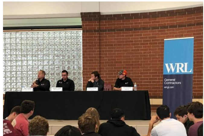
The Leavine Family Race team answered students questions at WISD High School.