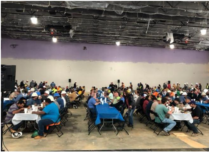
Over 450 subcontractors and guests enjoyed a barbecue lunch at the WISD new Junior High.