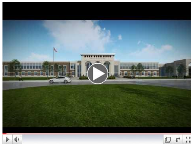
John Tyler HS Presentation

The Tyler ISD 2017 Bond Program is our most esteemed award to date. We have been building educational facilities in East Texas for 27 years and have partnered with 29 school districts. In 2012, we completed our most sizable educational project to date: the largest high school in East Texas, Hallsville High School at 400,000+ square feet. The $65 million project took 30 months and more than 1,100 people, including a crew of about 30 WRL employees at its highest point. These projects are our reputation and we are proud to be such a fundamental part of improving our communities.