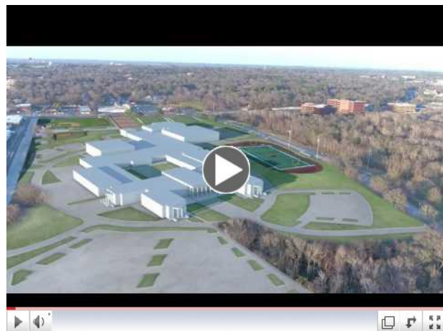
Robert E Lee HS Presentation