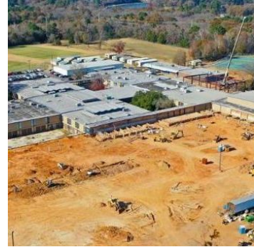
Tyler ISD John Tyler High School