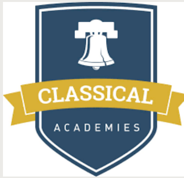
Classical Academy of Carrollton