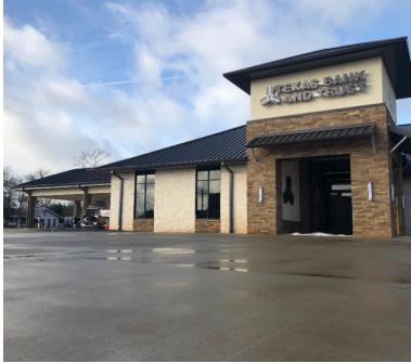
Texas Bank and Trust Lindale