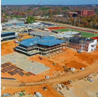
Tyler ISD Lee High School