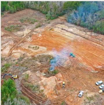
Classical Academy of Huntsville