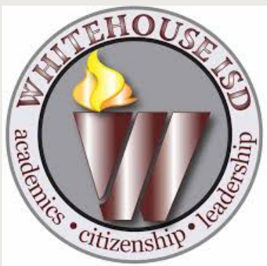
Whitehouse ISD Education Support Center